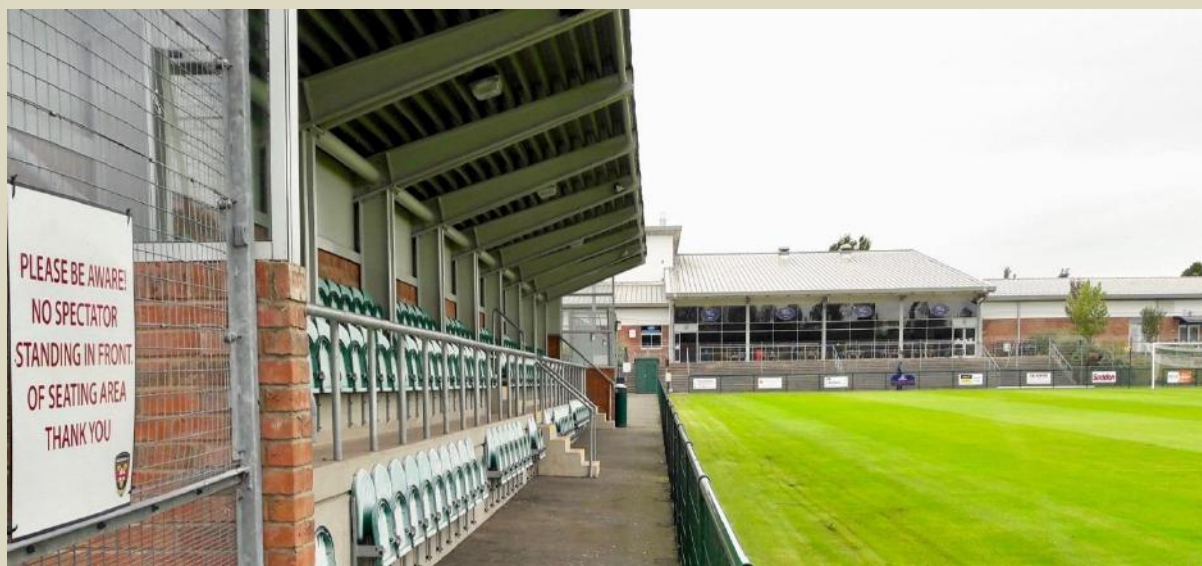
Stand and Pavilion

Take the M6 to junction 11 from the north take the first exit or third from south at the roundabout onto the Cannock Road and at the next roundabout take the third exit on to the M54 and continue onto the A5 and at the Preston Roundabout take the second exit onto the A49 and at the next roundabout take the first exit and take a left into the Sports Village and the ground is at the back of the sports centre